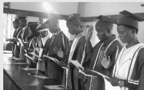
Some of the newly elected executives

The newly elected executives were presented with certificates of return as duly elected in a free, fair and unique, students' union election in the college while the Legal Unit of the college, administered oath of office.