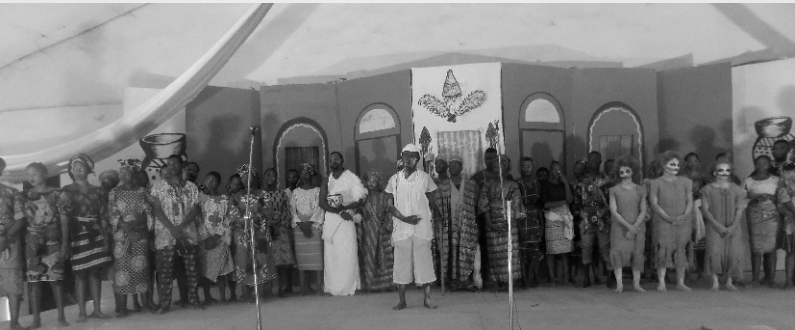
GROUP PICTURE OF MUSIC DEPT STUDENTS DURING THEIR PRESENTATION AT THE COLLEGE HALL B (ANCIENT POT)