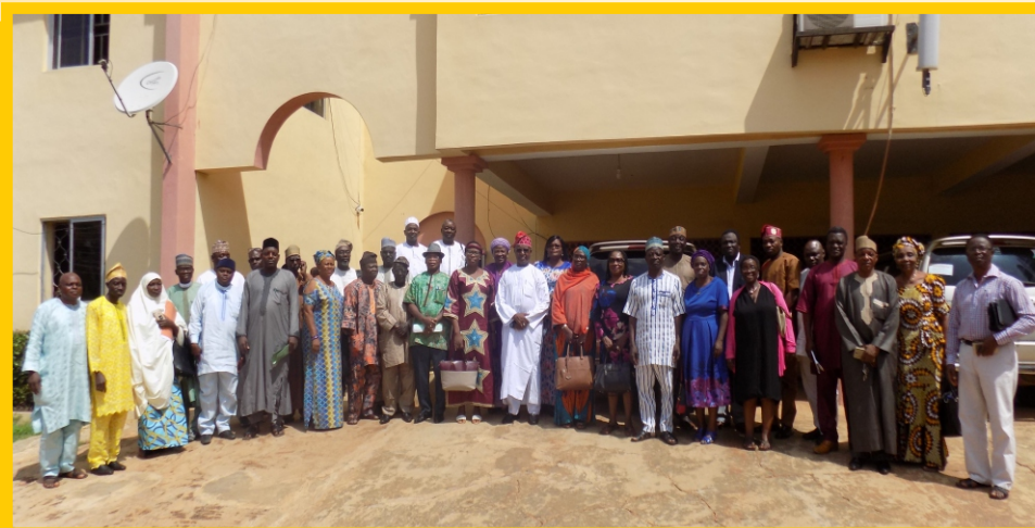
GROUP PHOTOGRAPH OF NUC VERIFICATION TEAM

The National Universities Commission (NUC) has approved the affiliation arrangement and the establishment of the full-time mode of some courses for Kwara State College of Education, Ilorin.